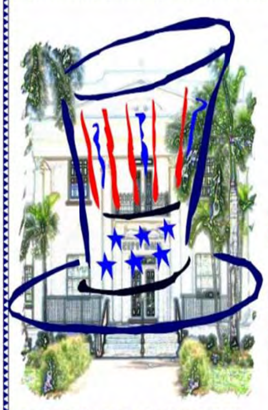
To take part in Arts & Crafts, phone Marya at 695-2905 To enter the parade, phone Elains at 695-2695